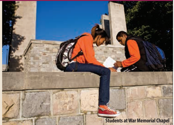
Students at War Memorial Chapel