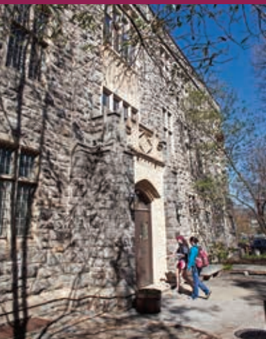
William D. Saunders Hall

"I have left a bequest to the dairy science department in memory of my grandfather, because I fear for the future of the independent dairy farmer in this country, because I love and have great pride in Virginia Tech, and because I know that my parents would want and approve of this gift," she says.